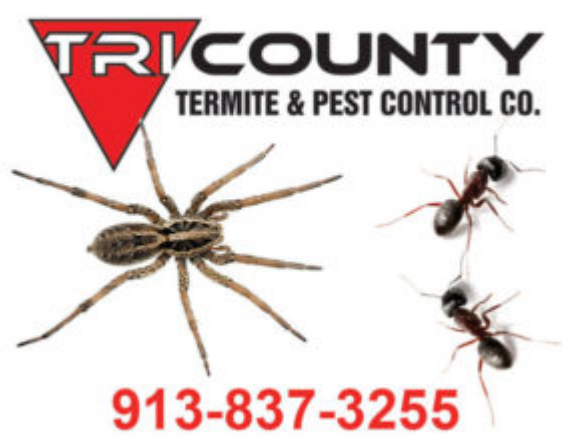
"Protecting you and your home"