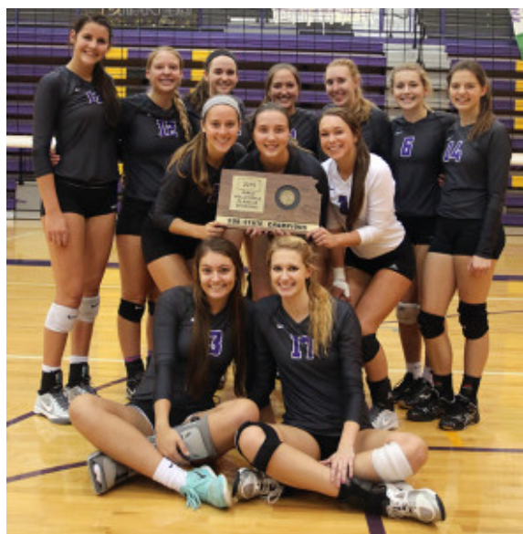
Members of the team (front