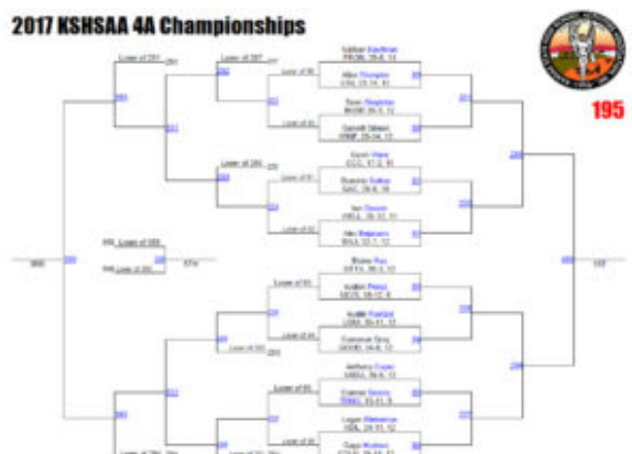
195 pound bracket – Austin Raelzel