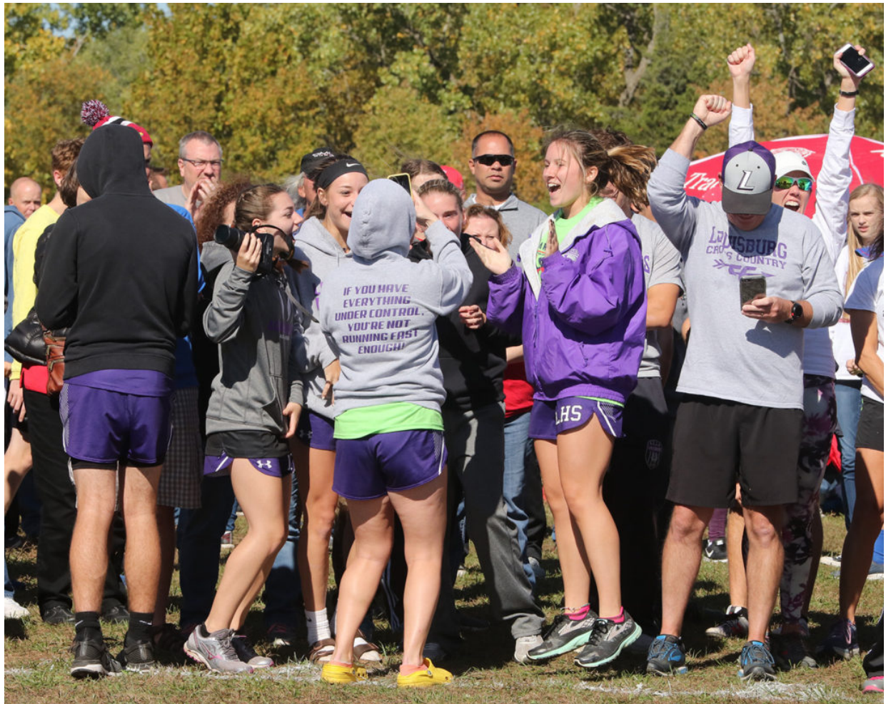
Louisburg runners and coaches celebrate the announcement of their regional runner-up finish.