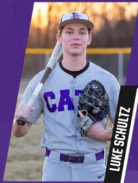
First Team - Infield