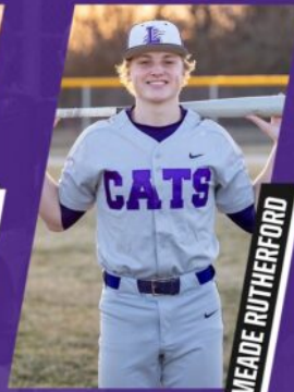
First Team - Pitcher