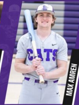
First Team - Outfield