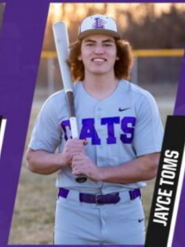
First Team - DH/Utility