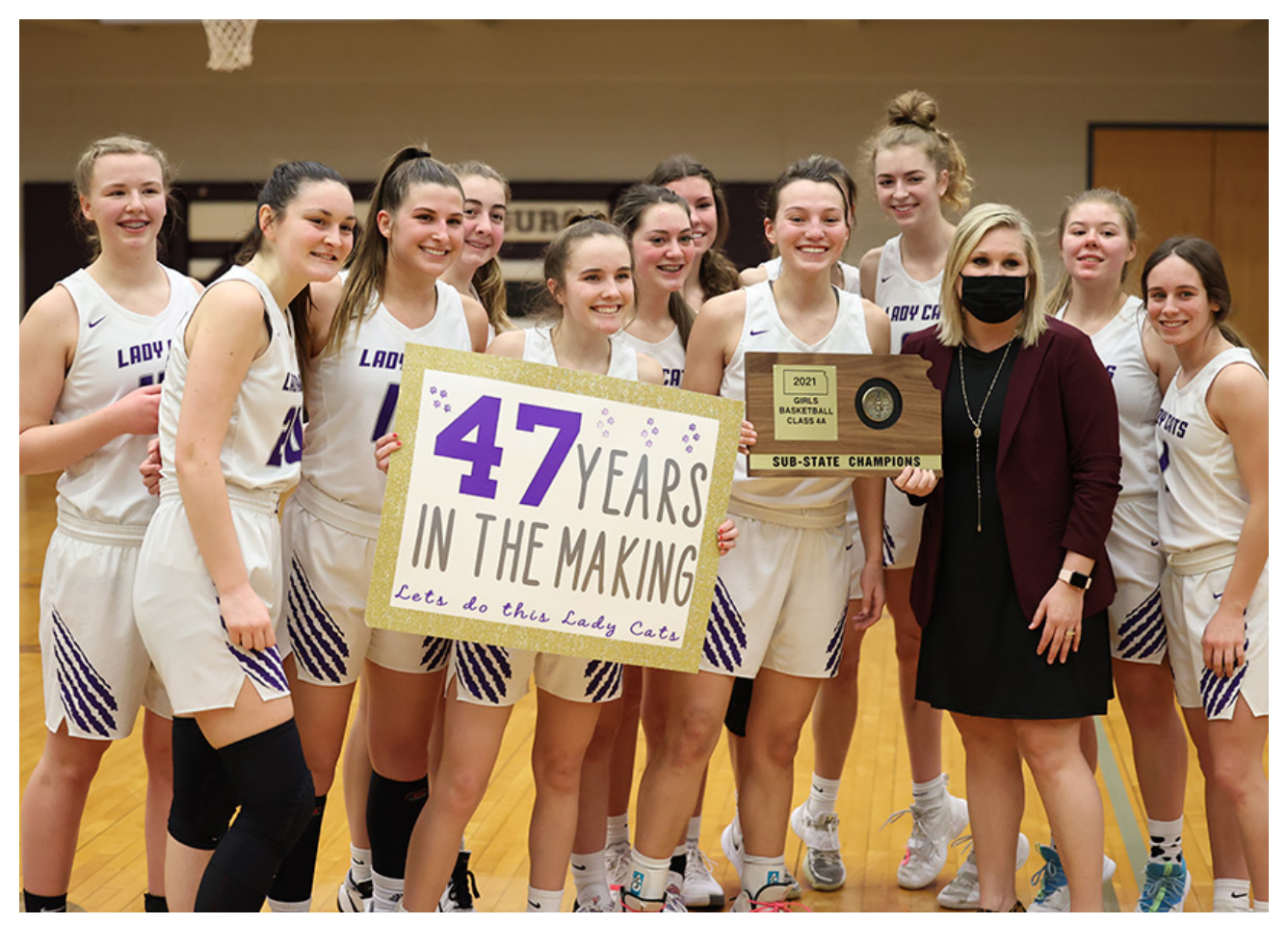
The Louisburg girls basketball team broke a 47-year state drought Saturday against Fort Scott.

Despite that, they won their first eight games and ended the season with an 16-4 record and finished second in a tough Frontier League.