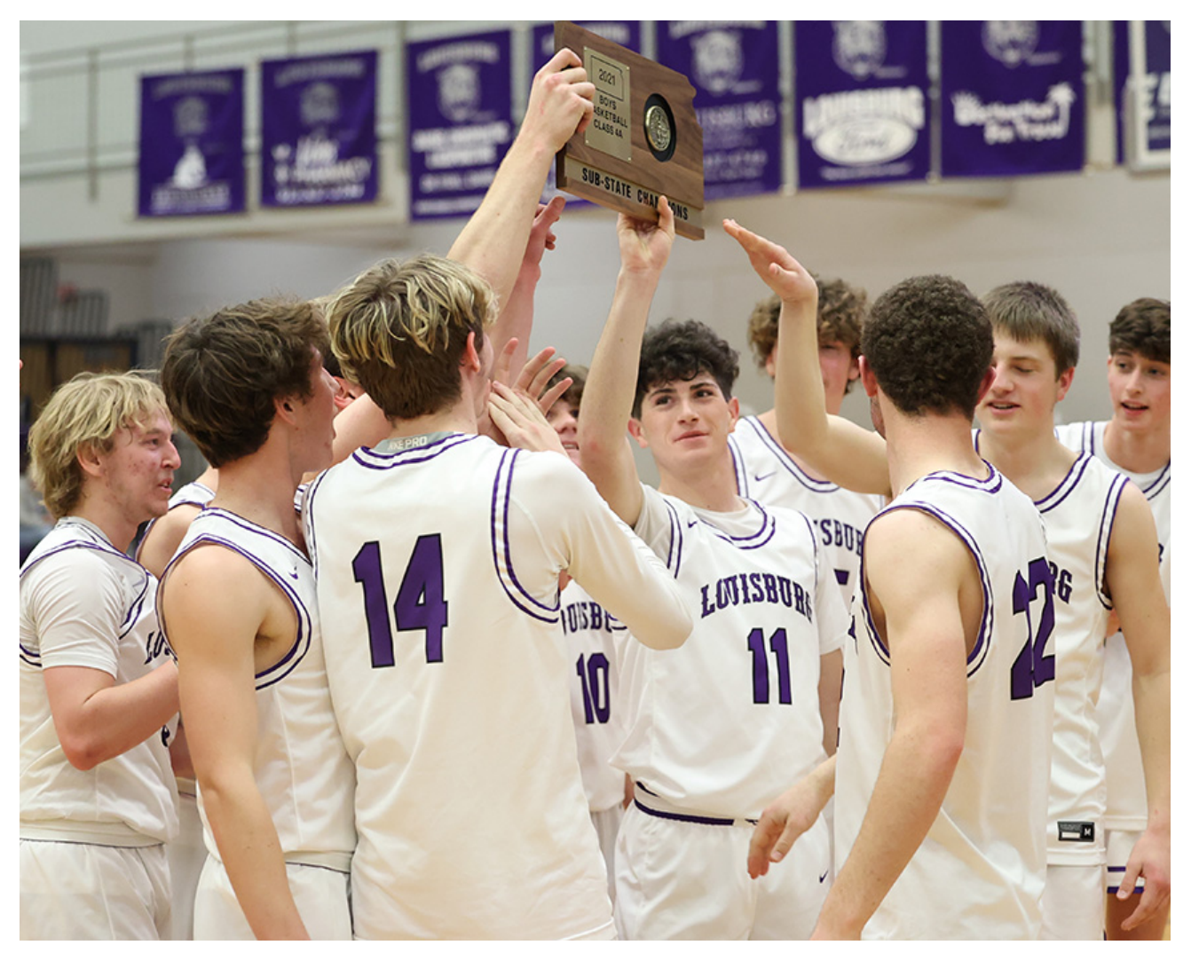
The Louisburg boys are onto their first state tournament since 2017.

Both teams are currently ranked in the top five in the state and are one of eight teams left standing in Class 4A. It is something that has never been done in school history.