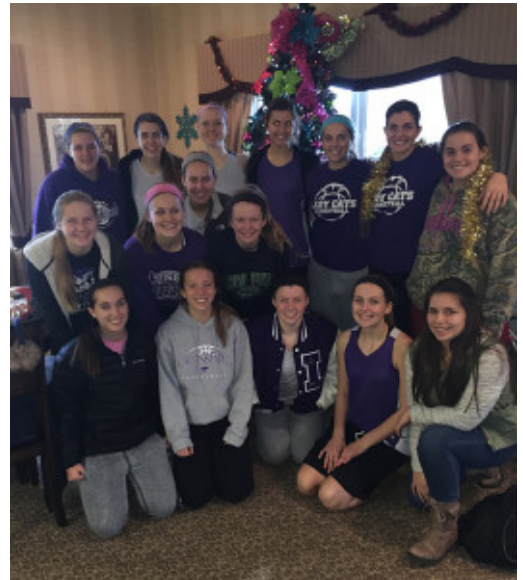
The LHS girls basketball team poses together after they helped decorate Louisburg Healthcare and Rehab for Christmas in December.

Speaking to elementary students was just one of a few different things the Lady Cats have done this past two months.