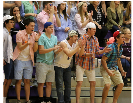
The Louisburg student section gets into the game