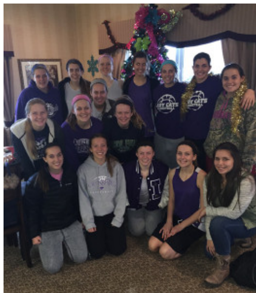
The LHS girls basketball team poses together after they helped decorate Louisburg Healthcare and Rehab for Christmas in December.

Speaking to elementary students was just one of a few different things the Lady Cats have done this past two months.