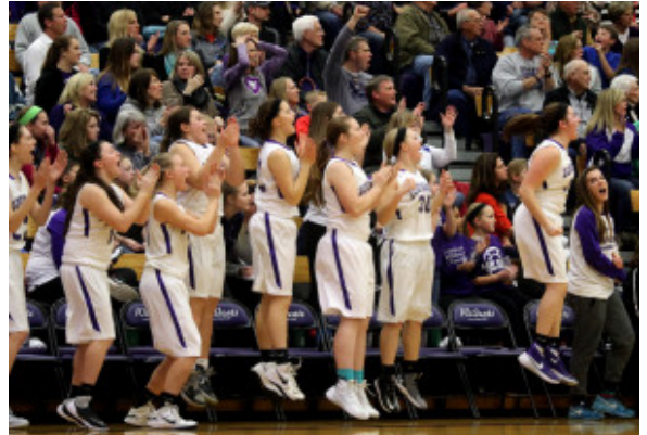
The Louisburg bench leaps into the air with excitement as the buzzer sounds in the Lady Cats' 27-25 win over Eudora.

In fact, the Lady Cats (3-12) held a two-point advantage for much of the contest and had the lead for all but one possession. Louisburg extended its lead on different occasions, but Eudora always narrowed the gap.