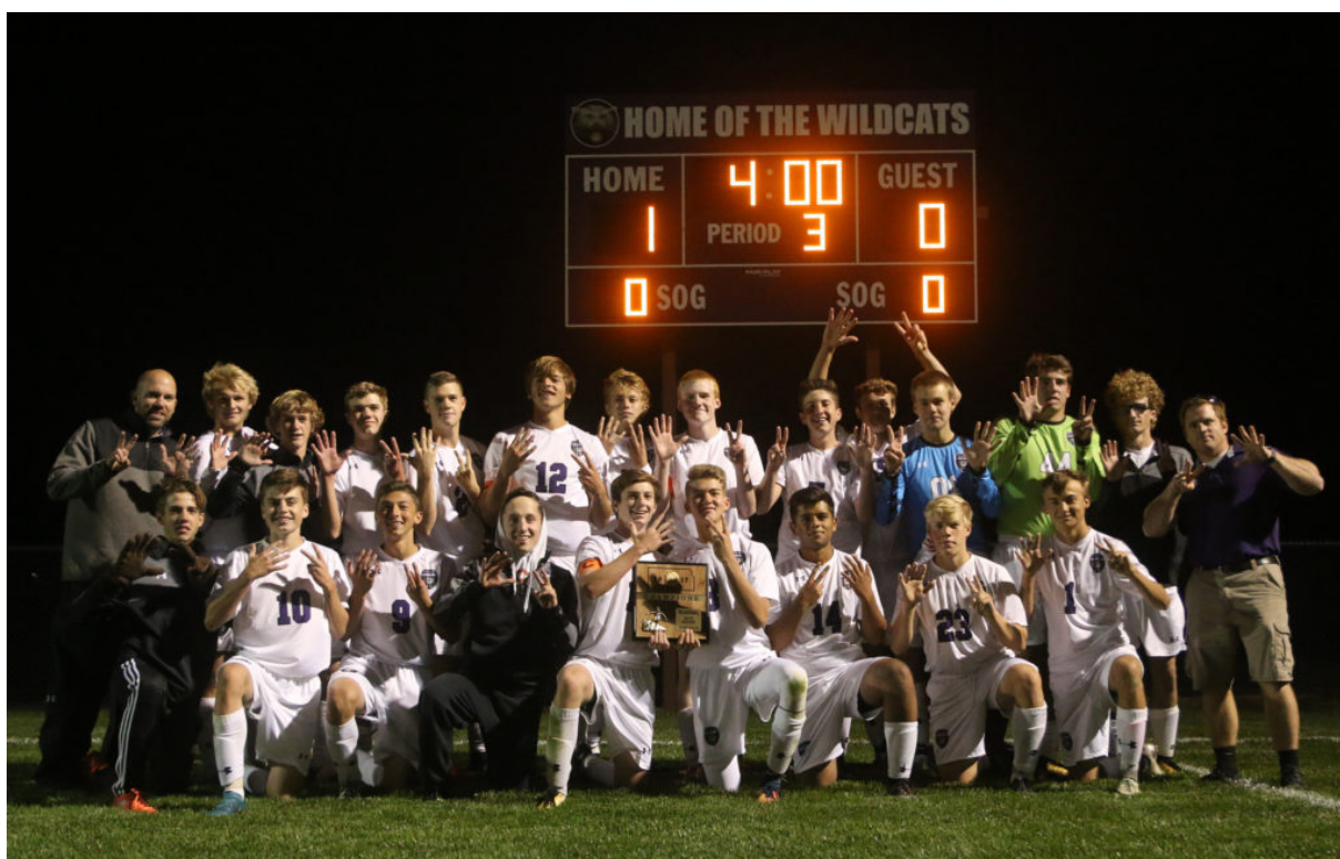
The Louisburg soccer team poses for a picture following the Wildcats regional championship victory over Independence. It was the seventh regional title in program history.