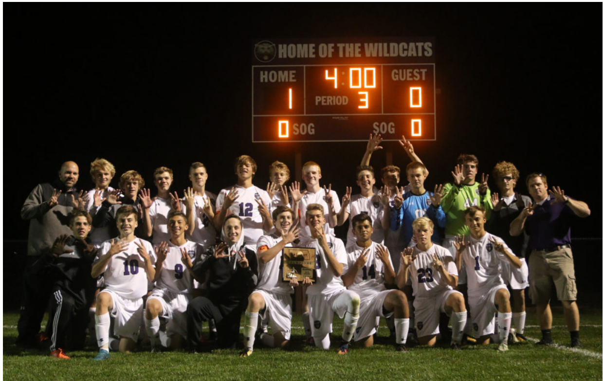
The Louisburg soccer team poses for a picture following the Wildcats regional championship victory over Independence.