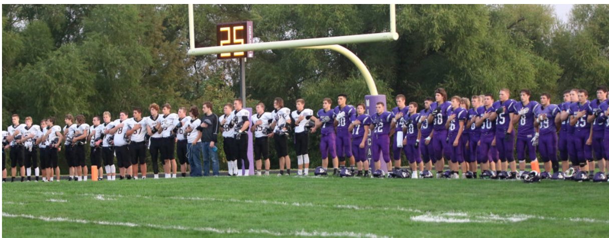
Members of the Louisburg and Spring Hill football teams stood together in the endzone for the national anthem.