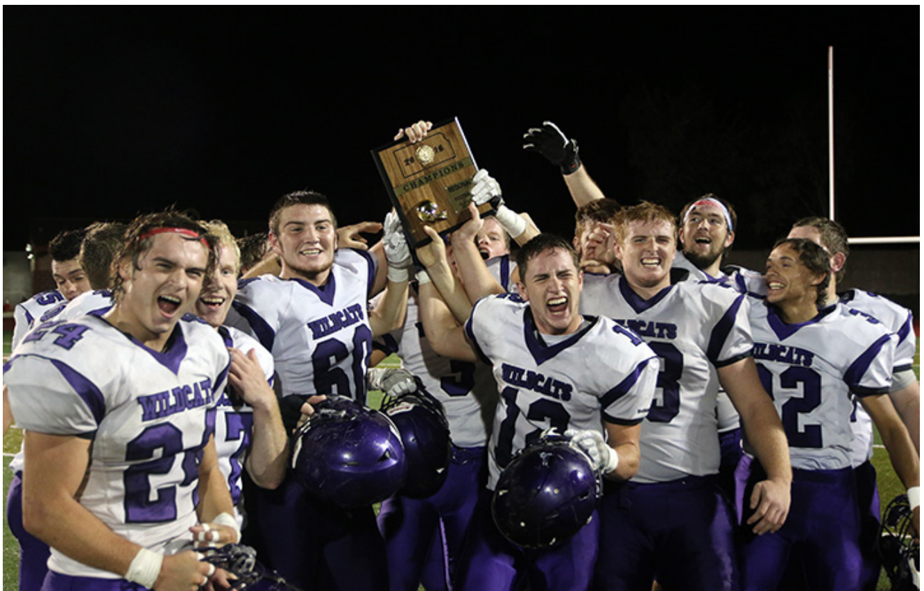
The Louisburg High School football team celebrates its