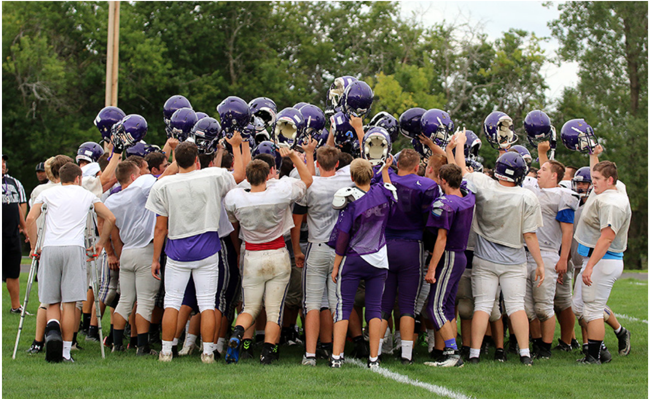
The Louisburg football team huddles together before last week's scrimmage