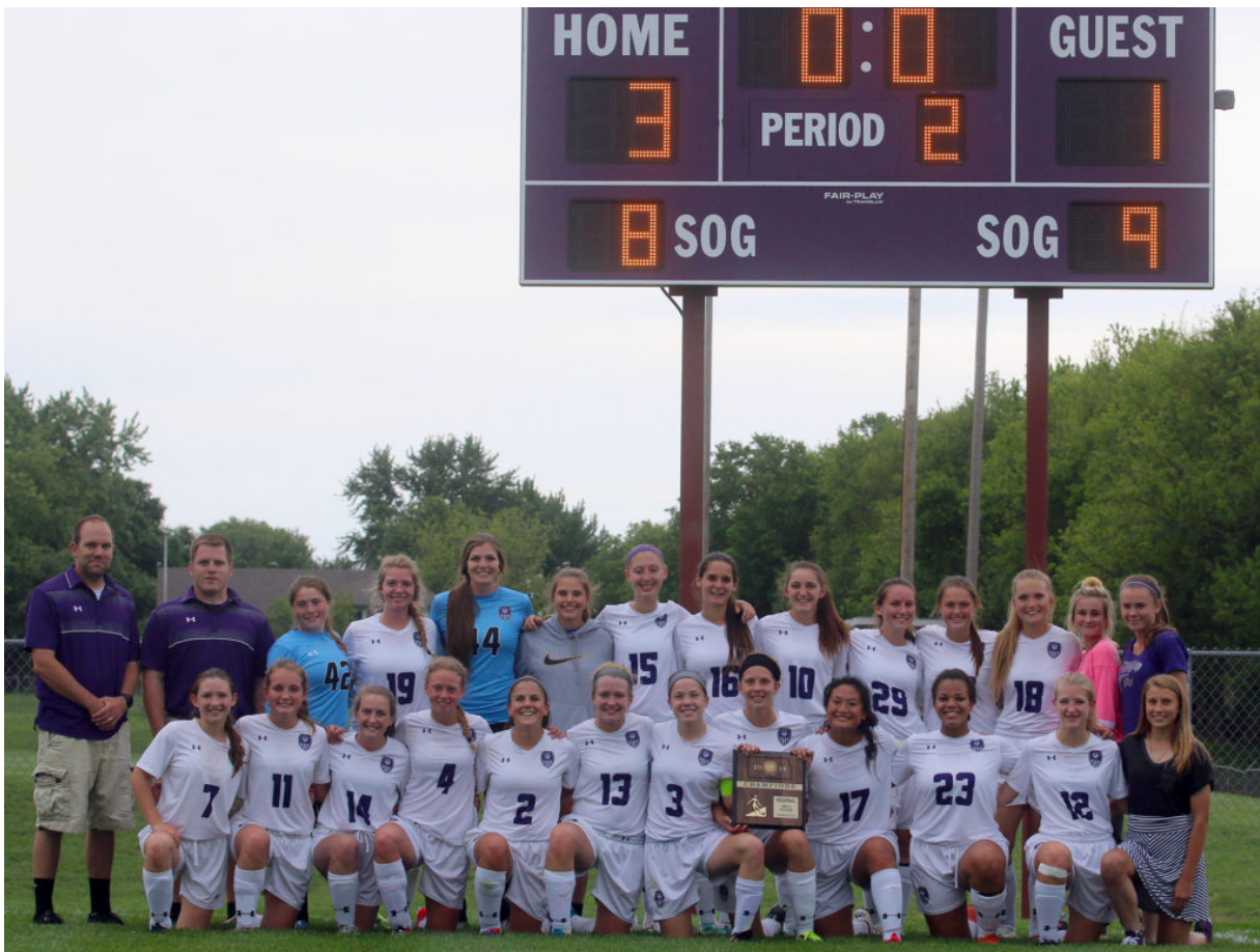
The Louisburg girls soccer team poses with their regional championship trophy Thursday following its 3-1 victory over Basehor-Linwood.

before. Even if we have been playing for years and years, it is still a big accomplishment. I couldn't be happier right now."