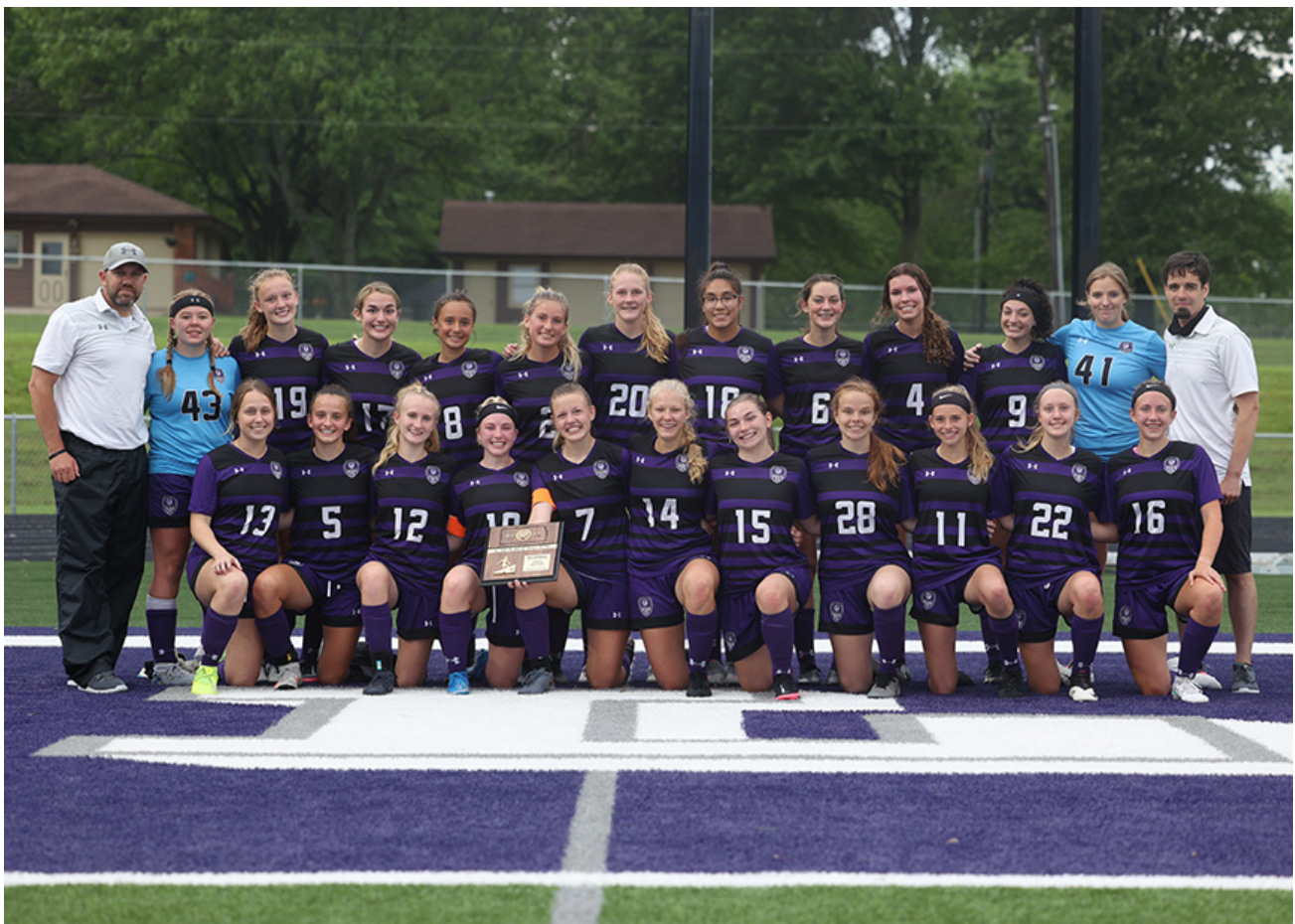
Members of the regional champion Louisburg girls soccer team