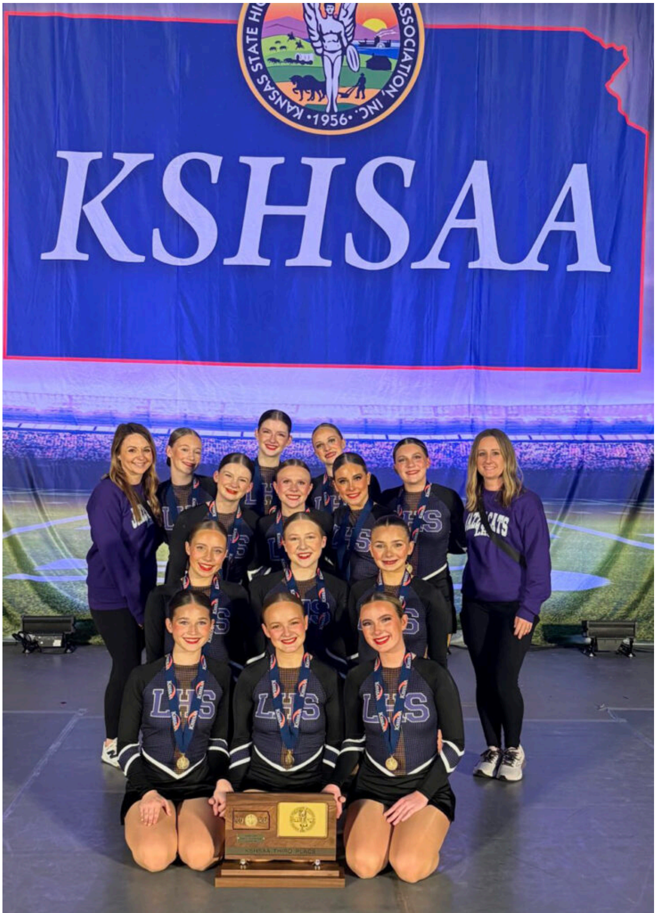
The Louisburg Jazzy Cats pose with their third place state plaque.