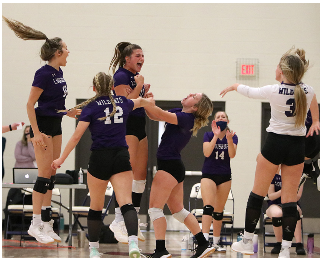
The Lady Cats celebrate a big play against Bishop Miege at Eudora High School.