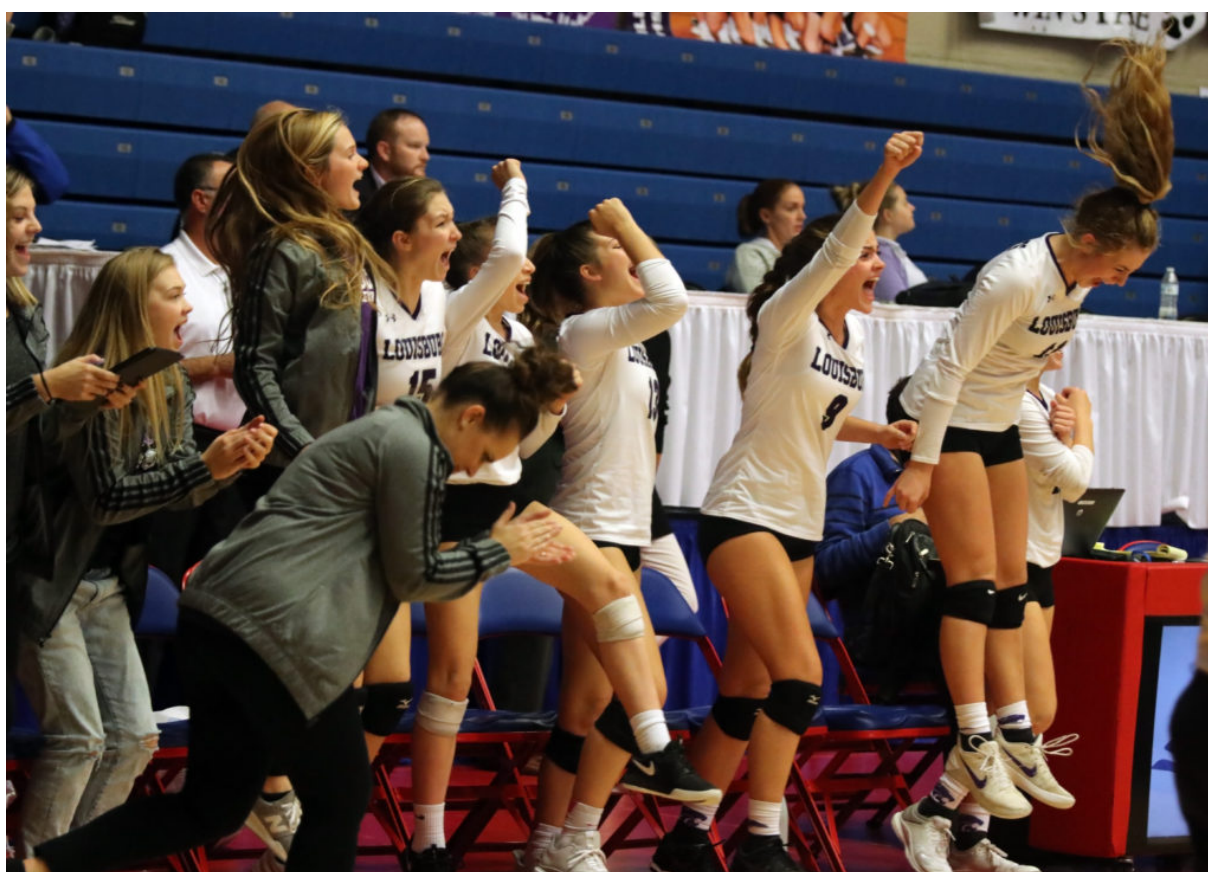
The Louisburg bench erupts after securing the win against Topeka-Hayden on Friday to finish pool play undefeated.