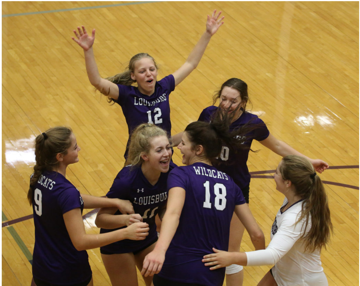
Members of the Louisburg volleyball team celebrate a big point Saturday during the Louisburg Invitational.