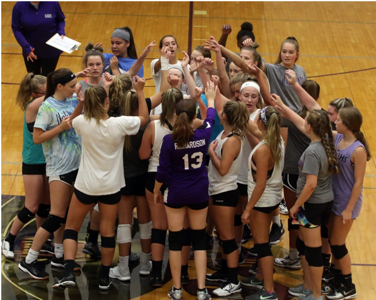
LHS freshmen and sophomore volleyball players gather at center court during tryouts Monday.

On the volleyball side, the Lady Cats had 34 athletes show up for the first day of tryouts, which will end on Wednesday as Louisburg begins its quest to get back to the state tournament after finishing second a year ago.