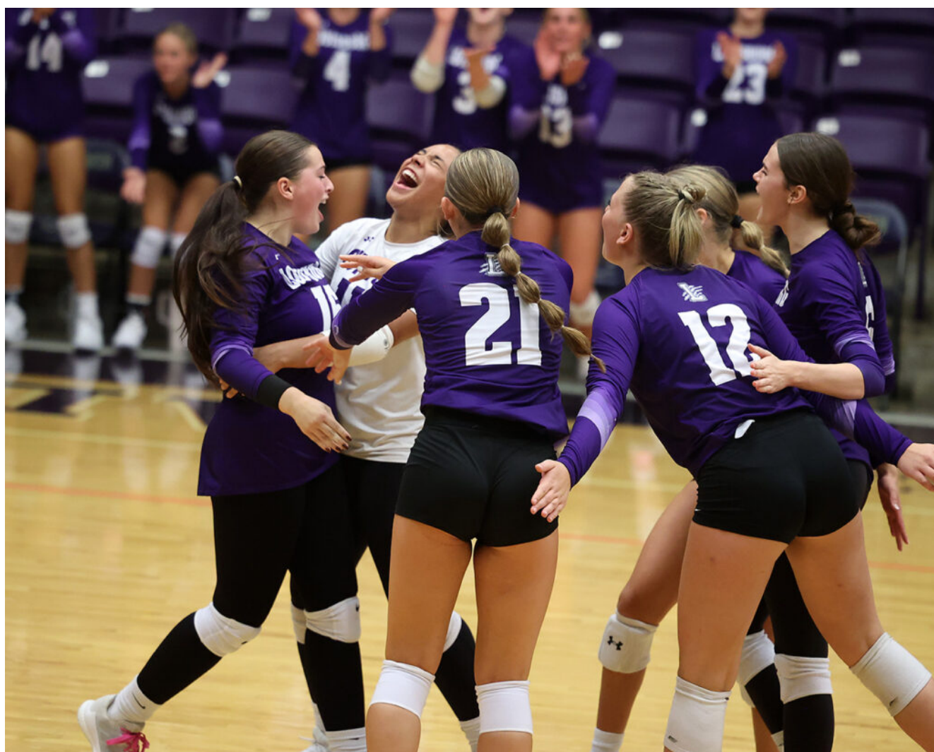
The Louisburg volleyball team celebrates following a point